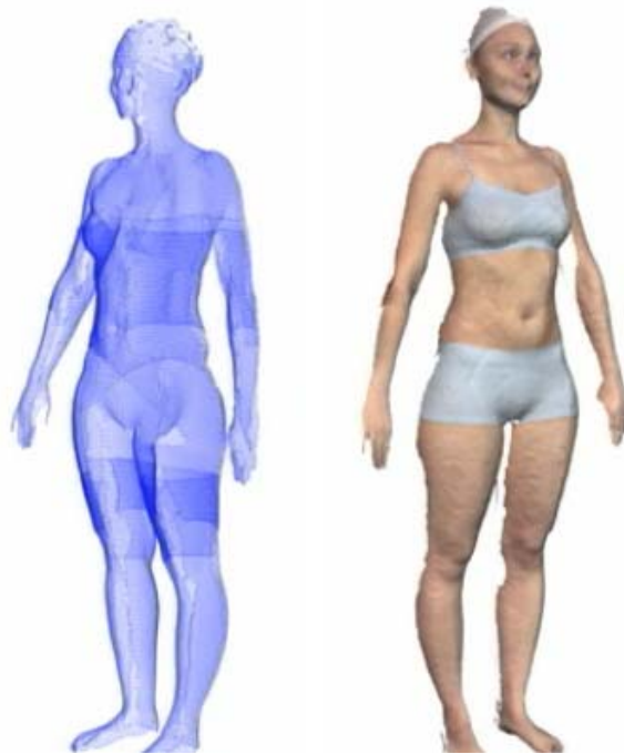
Fig.2. Measured Human Body. Left: Point cloud without texture. Right: Textured point cloud.