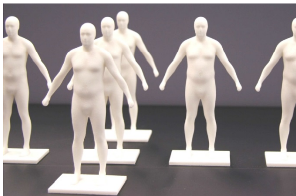
Fig. 1: Examples of mini-mannequins of the Spanish male population

This paper describes the main results of the three Spanish surveys. And it also presents series of tools that will help the apparel manufacturers and retailers to make an effective use of Spanish databases in the design and labelling of products addressed to the Spanish market following the forthcoming size designation interval standards (EN 13402). These tools consist of a website providing with the basic anthropometric statistics, two books with the population measures by age range (one for female and one for male populations), a collection of digital mannequins and a collection of physical mini-mannequins (scale 1/20). Moreover, the access to the 3D databases makes possible to IBV to extend the use of these data for the provision of new consultancy services for clothing companies about how to improve garment design and fitting.