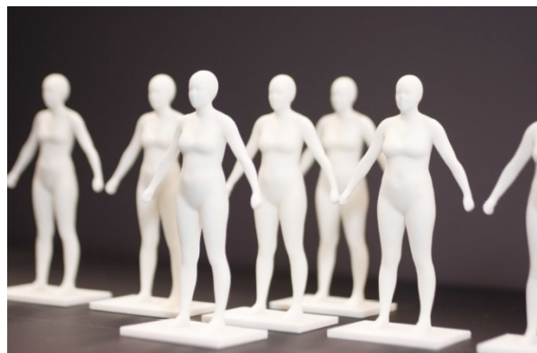
Fig. 2: Examples of mini-mannequins of the Spanish female population