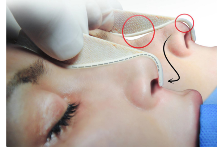
Fig. 3. Multi-dimensional compliance evaluation of rhinoplasty surgical guide with the nose shape.

Stages of rhinoplasty using surgical guides are: 1) 3D scanning and preparing the applicant's 3D model in the software; 2) Consultation with the surgeon, and apply changes based on the applicant's desires and surgeon's opinions on the nose 3D model; 3) Reaching to a mutual understanding between the applicant and the surgeon, and confirmation of the designed nose; 4) Production of the surgical guides with 3D printers based on the simulated 3D result; 5) Providing exact analyzes by comparing 3D models of the nose and the simulated result; 6) Performing rhinoplasty using Surgical guides and analyzes; 7) Examining the compliance of the surgical guide with the recently-operated nose (see figure 3).