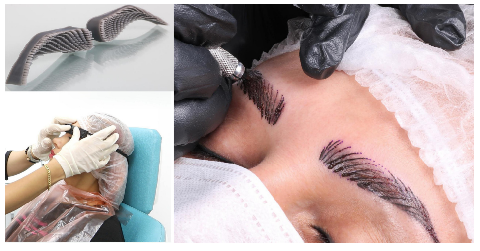
Fig. 5. Tattooing the hair strokes printed by eyebrow stencil.

Stages of microblading using eyebrow stencils are: 1) 3D scanning and preparing the applicant's 3D model in the software; 2) Consultation with the beauty professional, and apply different eyebrow models based on the applicant's desires and professional opinions on the face 3D model; 3) Reaching to a mutual understanding between the applicant and beauty professional, and confirmation of designed eyebrow; 4) Producing an eyebrow stencil based on the simulated result; 5) Soaking the stencil with high durability ink and placing it on the face using artificial intelligence for proper positioning; 6) Tattooing the hair strokes marks which are based on the pre-designed eyebrow model (see figure 5).