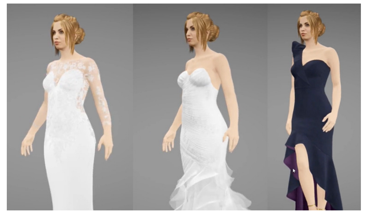
Fig. 8. Trying different clothes on a 3D body model.

By widespread distribution of these scanners in the market, reputable clothing brands can provide a suitable platform for customers to use various 3D home scanners to virtually try different clothes on their body and view it on the TV or using a VR glass. Since 3D models have accurate information about the size of the person's body, people can shop online and make sure that the size of the clothes ordered fits their bodies (see figure 8). This method can also be used in clothing design, through which people can select their desired texture, color, pattern, etc. and try the desired design on their 3D model and make online orders. Tailors can use these 3D designs to sew ordered clothes needless of in-person visits.