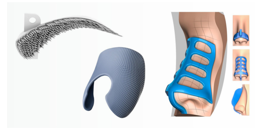
Fig. 2. Smart Beauty patented stencils and guides.