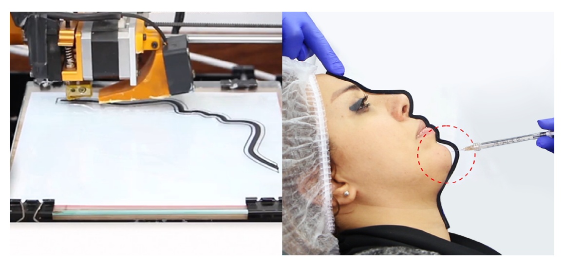
Fig. 4. 3D printed injection guide, and the use of the guide during filler injection.